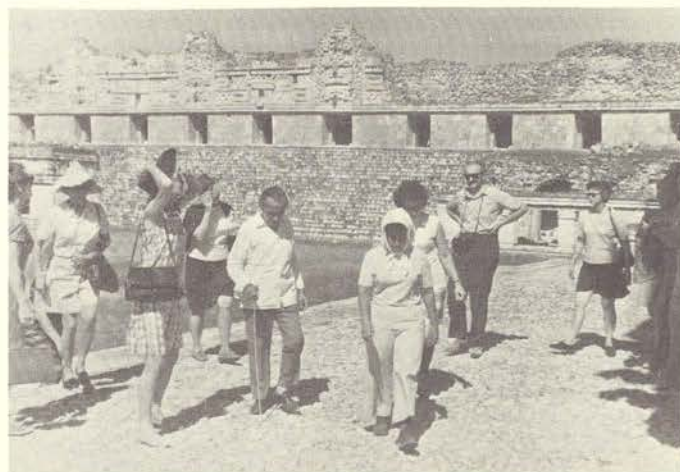
Members of the SAH Pre-Columbian Tour at Uxmal, Yucatan, December 30, 1969.

December 31st was made memorable by two events. Chichen Itzá was once the Maya center of political and religious power between the 10th and 13th century A.D.