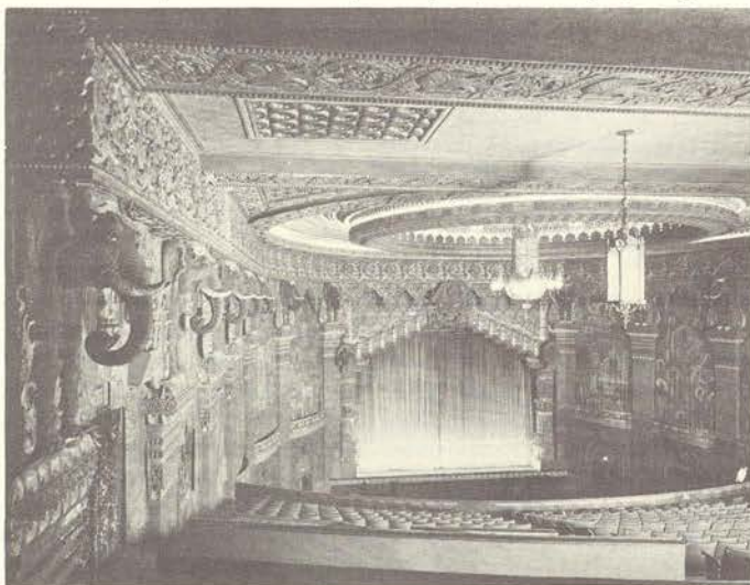
Oriental Theatre, Portland, Oregon, 1927. Recorded for HABS before its demolition in 1969.