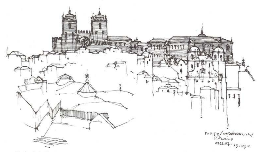
Cathedral, Porto Drawing by Earl Drais Layman