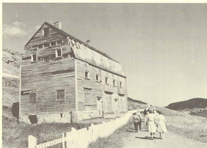
Ryan premises (after 1761), Trinity.