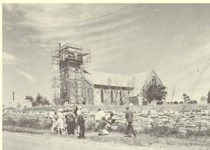
St. Paul's Anglican Church (1835) at Harbour Grace.