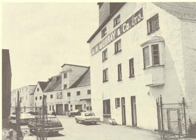
Murray warehouses, at St. John's