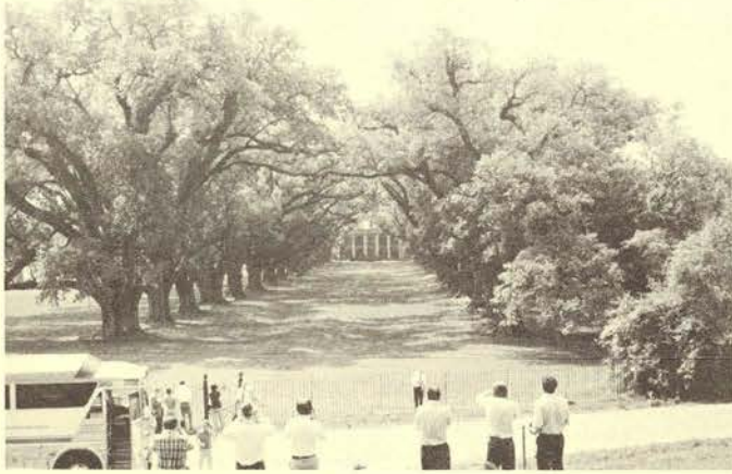
Oak Alley, On Plantation Tour

Finally, three busloads of diehards made the Monday trip of those sugar plantations lining the Mississippi from New Orleans halfway to Baton Rouge. Rain the night before followed by clearing gave a soft, aqueous brilliance to the day, with spring blossoms just making an appearance—all of which was precisely right for the occasion. Home Place, Evergreen, Oak Alley, Houmas House, Bocage, Hermitage (with a lunch of chicken gumbo under the oaks—again the right touch), San Francisco, Ormond, Destrehan: up one bank of the River,