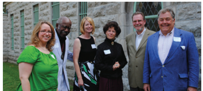
Members of SAH Bethune Chapter celebrating Bethune's 155th birthday.

Born on July 21, 1856, Louise Bethune graduated from high school in Buffalo and went to work for several local architectural firms, where she mastered her drafting and architectural design techniques. She is credited with the design of the Hotel Lafayette in downtown Buffalo (for which she earned a commission equal to $1 million today), as well as Offerman Stadium and more than 18 schools in the area. Her professional reputation brought her enthusiastic admission to the Western Association of Architects in 1885. Bethune was a major organizer in 1886 of the Architects Association in Buffalo, called the Buffalo Chapter of the American Institute of Architects. In 1891 when it became the Buffalo Chapter of the American Institute of Architects. In 1888, she was elected to membership in the American Institute of Architects; in 1889, she became its first woman Fellow when the Western Association of Architects was merged with the Institute. She was an active AIA member throughout her career and held chapter office as vice president and treasurer.