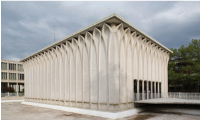
Minoru Yamasaki, Wayne State University.

The 65th annual meeting of the Society of Architectural Historians will be held in Detroit, Michigan, April 18-22, 2012. This is an ideal opportunity to visit a city in transition and to see firsthand what has been covered in The New York Times , Time magazine, and other publications – that Detroit is beginning to experience a creative resurgence.