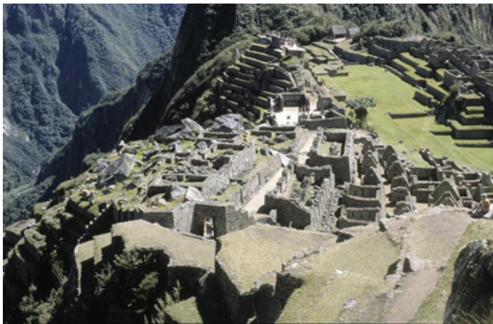
Machu Picchu

Similarly, I hope to use SAHARA to understand buildings that I teach in surveys but haven't yet seen. It's often difficult to get a clear sense of them from the relatively limited and standardized images in published texts or commercial image banks. I hope people will post a wide variety of images, even idiosyncratic ones.