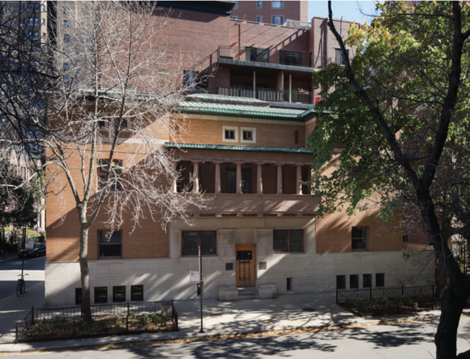
Charnley-Persky House

Newsletter of the Society of Architectural Historians September 2011 Volume LV, No. 3