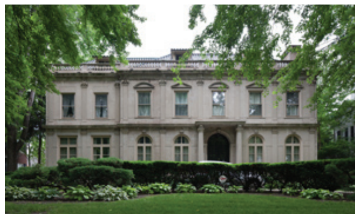
Louis and Emily Kling Kamper House, Detroit.