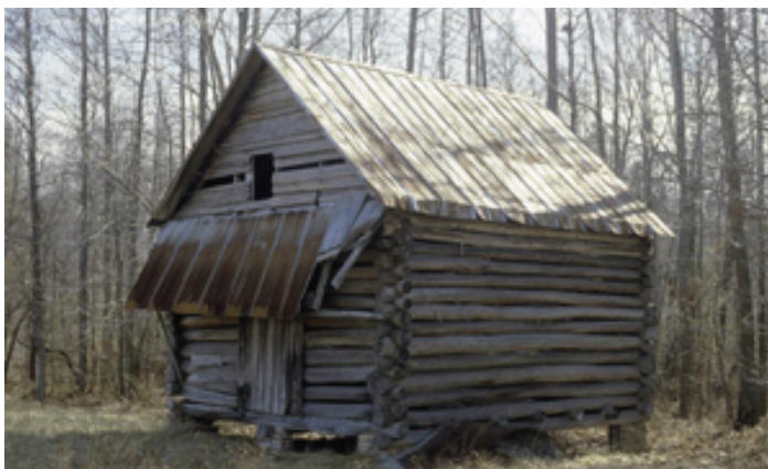
Nurney House