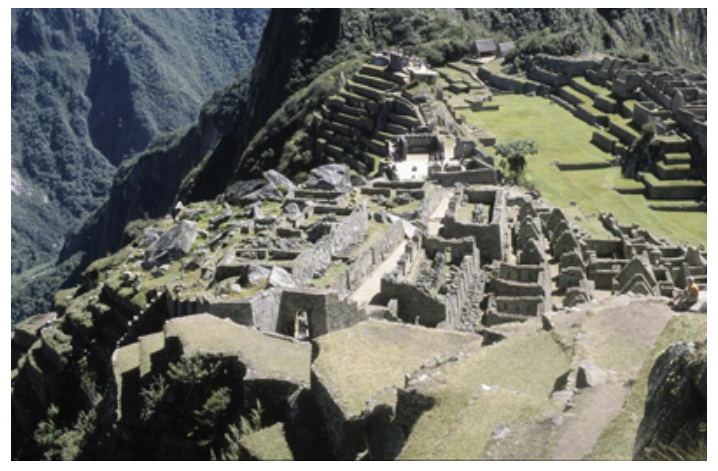
Machu Picchu

Similarly, I hope to use SAHARA to understand buildings that I teach in surveys but haven't yet seen. It's often difficult to get a clear sense of them from the relatively limited and standardized images in published texts or commercial image banks. I hope people will post a wide variety of images, even idiosyncratic ones.