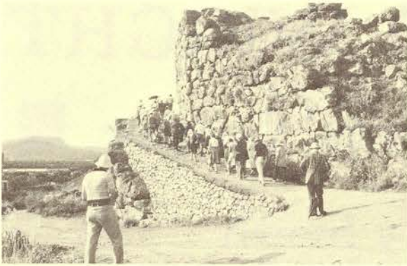
SAH triumphal entry into Tiryns