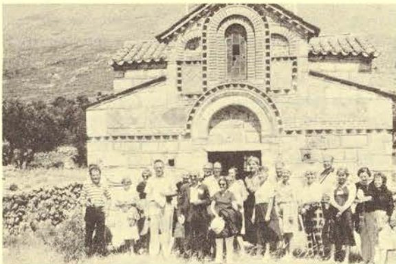
SAH "discovers" way-side chapel en route to Sparta