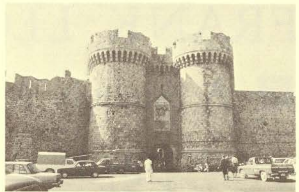
(Rhodes) Walls: Gate of Amboise (c. 1512)