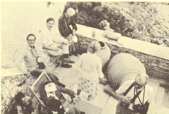
Cocktails at Monemvasia