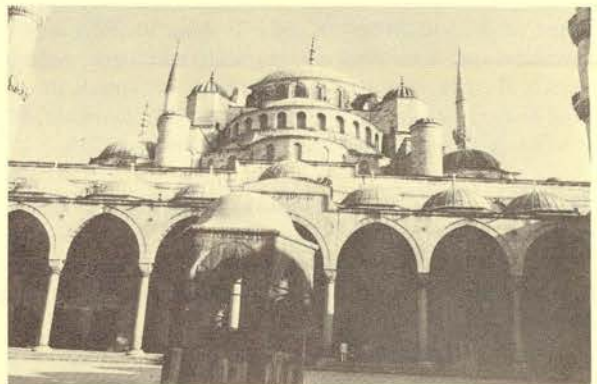
(Istanbul) Blue Mosque