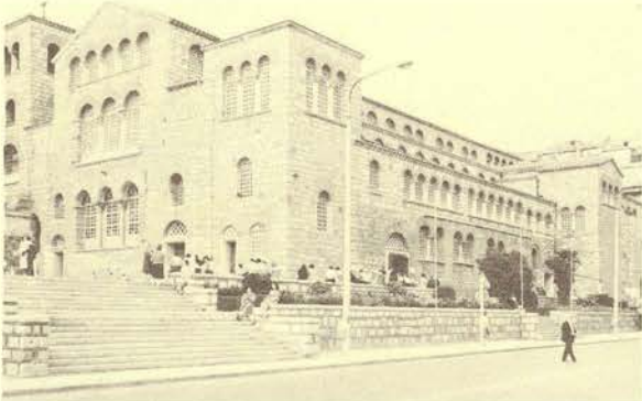
Ay Dhimitrios Salonika