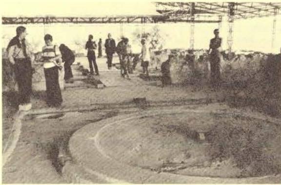
Megaron of Nestor's Palace