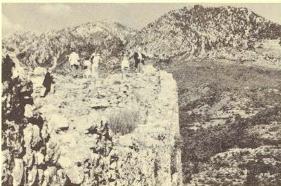
SAH in heights of Mistra (the castle)