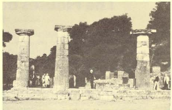
(Olympia) Temple of Hera