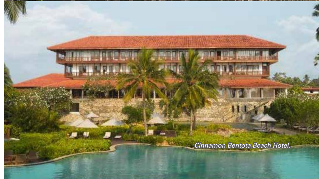
Cinnamon Bentota Beach Hotel.