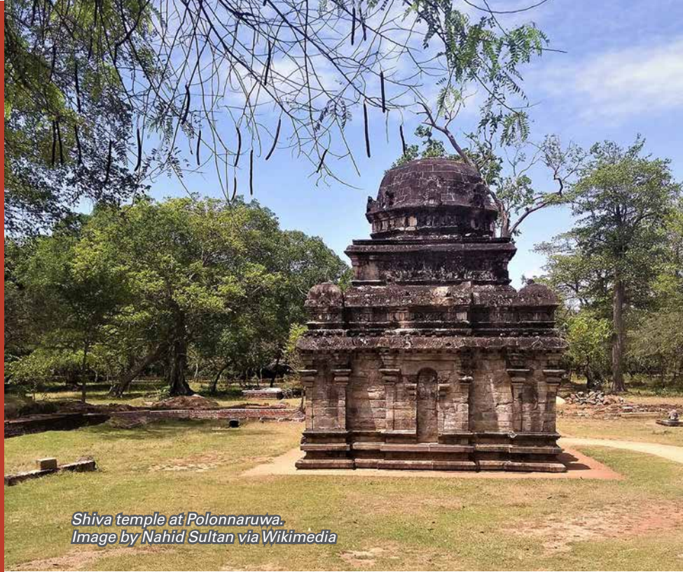
Shiva temple at Polonnaruwa.