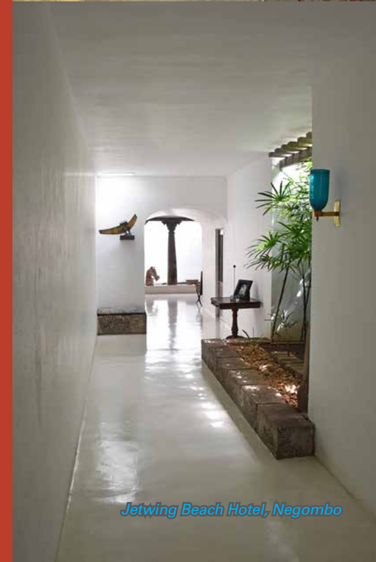
Jetwing Beach Hotel, Negombo