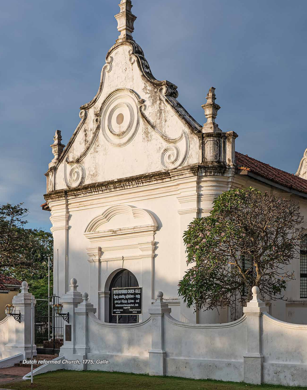
Dutch reformed Church, 1775, Galle.