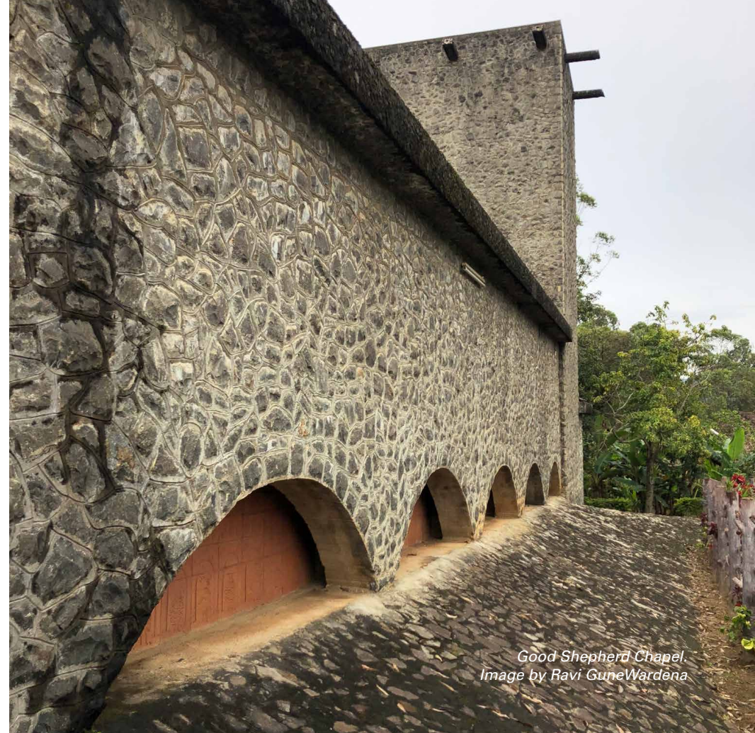
Good Shepherd Chapel. Image by Ravi GuneWardena

Accommodation: Jetwing Lighthouse Meals: Breakfast, Lunch, Dinner