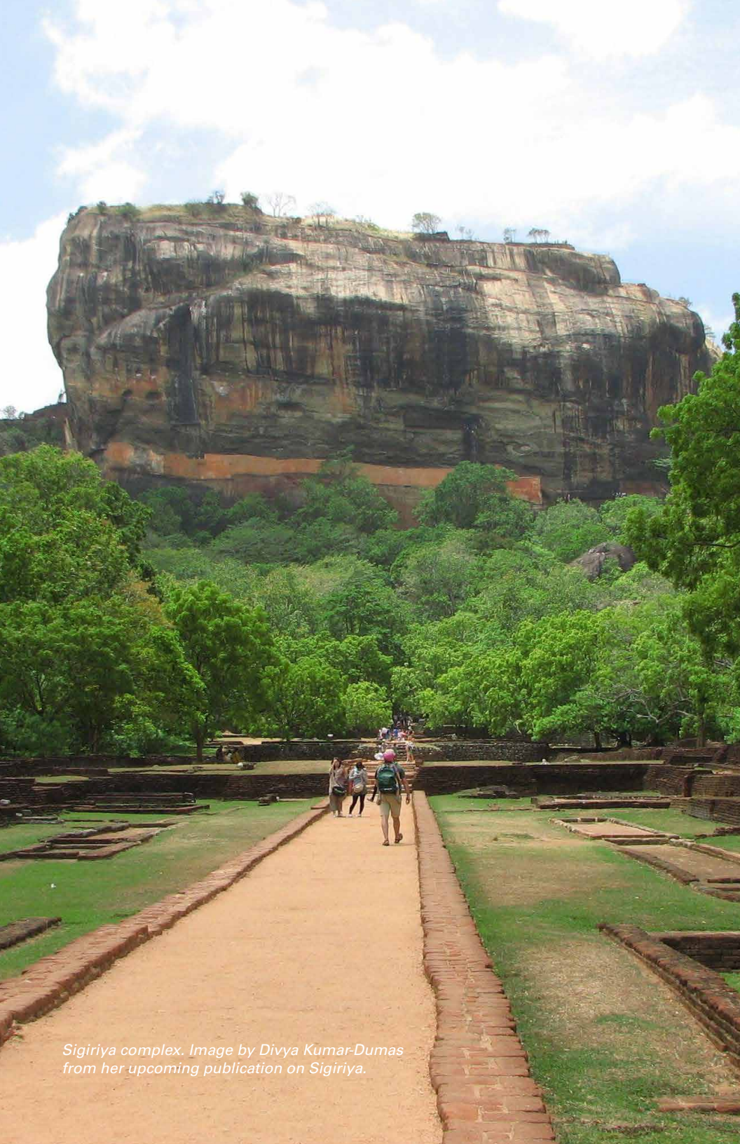
Sigiriya complex. Image by Divya Kumar-Dumas from her upcoming publication on Sigiriya.