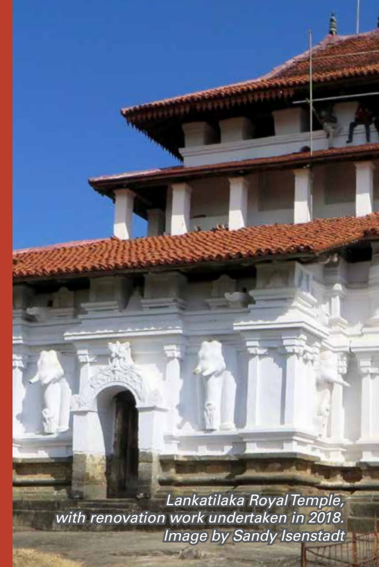
Lankatilaka Royal Temple, with renovation work undertaken in 2018.